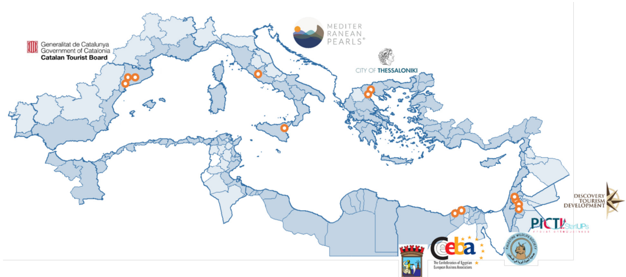
Figure 1 – Pilot areas where the Slow Tourism Products are being developed

These products all over the Mediterranean which share similar characteristics are currently being developed following the Slow Tourism spirit and offering equivalent experiences in the different countries, although fully adapted to each local context. Thus, the Mediterranean region will become a unique platform to enjoy Slow Tourism experiences for international visitors looking for genuine tourism experiences at a reduced pace.